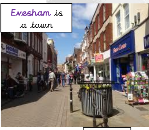
Evesham is a town