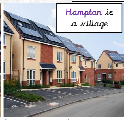
Hampton is a village