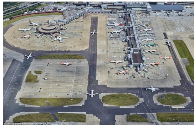
Ariel view of an airport