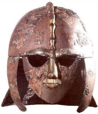
Helmet from the Sutton Hoo Ship Burial

Many towns and villages still carry their Anglo-Saxon names today, including "England" which comes from the Saxon word "Angle-Land" .