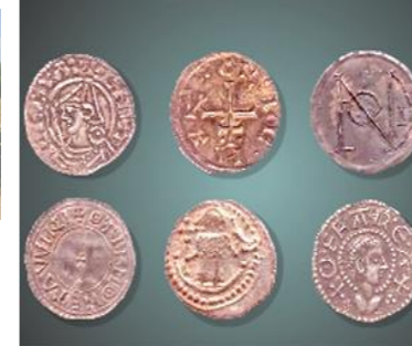
Anglo Saxon Coins

The Anglo-Saxons didn't like the stone houses and streets left by the Romans, so they built their own villages. They looked for land which had lots of natural resources like food, water and wood to build and heat their homes, and Britain's forests had everything they needed. They surrounded each village with a high fence to protect cattle from wild animals like foxes and wolves, and to keep out their enemies, too!