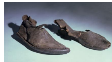
Anglo Saxon Shoes

They were fierce people , who fought many battles during their rule of Britain - often fighting each other! Each tribe was ruled by its own strong warrior who settled their people in different parts of the country.